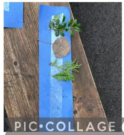
Oak Class: In geography this week we made a journey stick of things we found on our journey from the class to the eco zone.