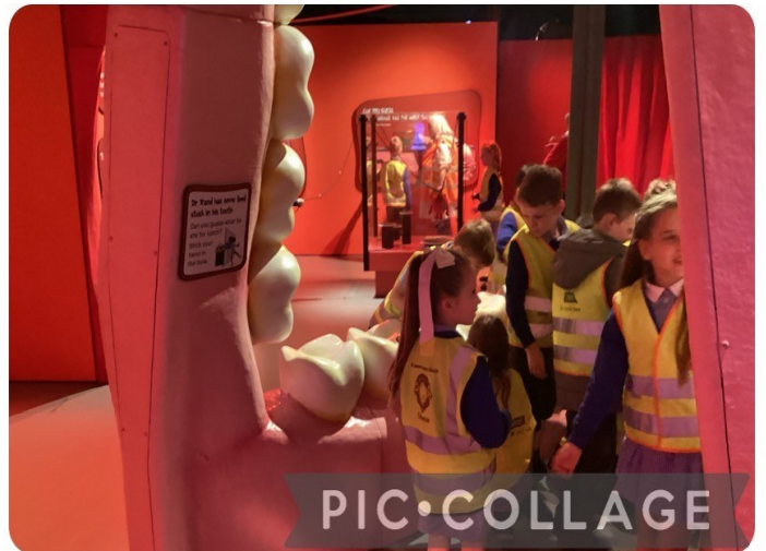
Birch Class had a brilliant time at the Museum of Science and Industry.