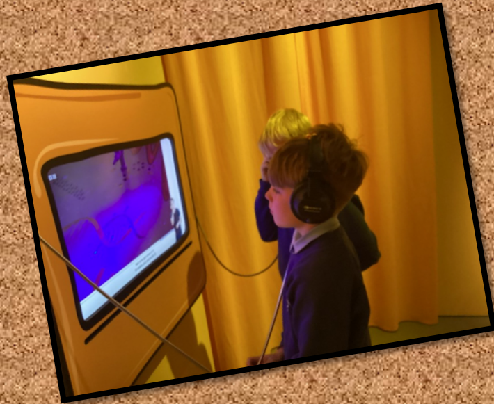
Chestnut Class had a fantastic time at Manchester Museum of Science and Industry.