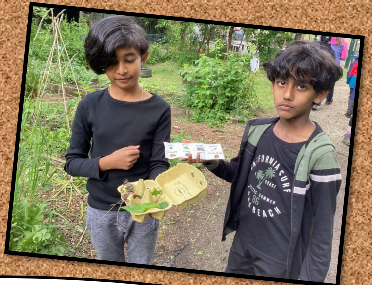
Rowan Class have had a fantastic time in Forest School this week.