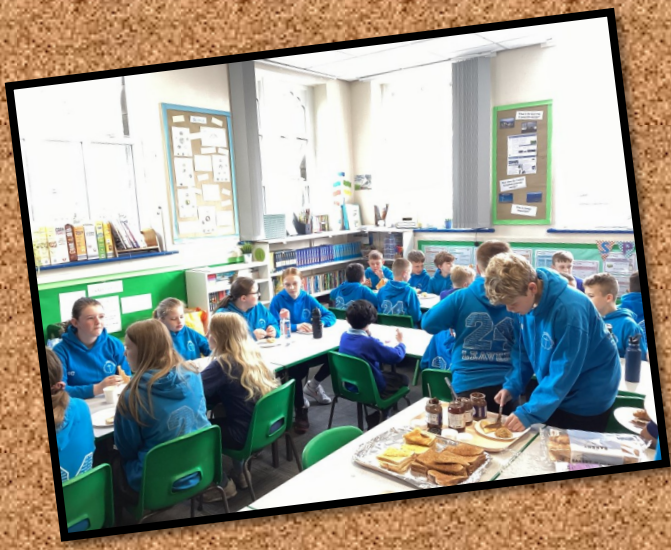
Year 6 enjoying their SATS breakfast!