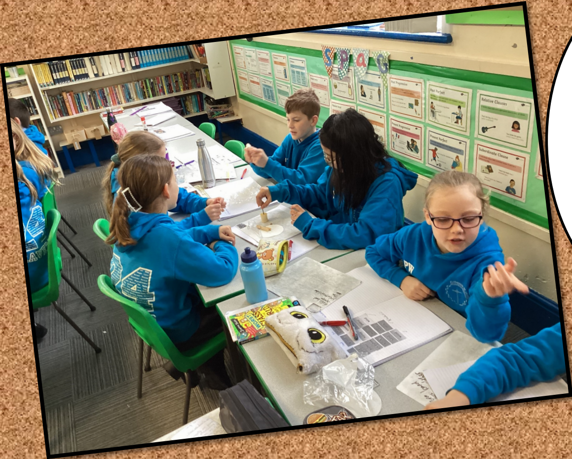
Sycamore Class: In Science, we have been discussing the properties of materials. Children had a lovely discussion over a variety of items and how they would sort them in a Venn diagram.