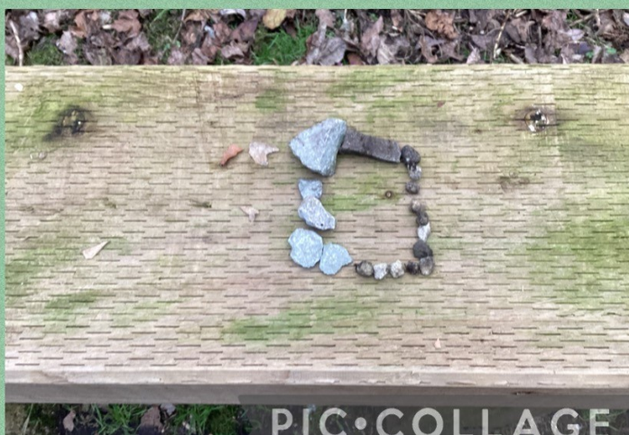
Ash Class took their Maths learning into the Eco Zone making 2d shapes and repeating patterns with natural resources.