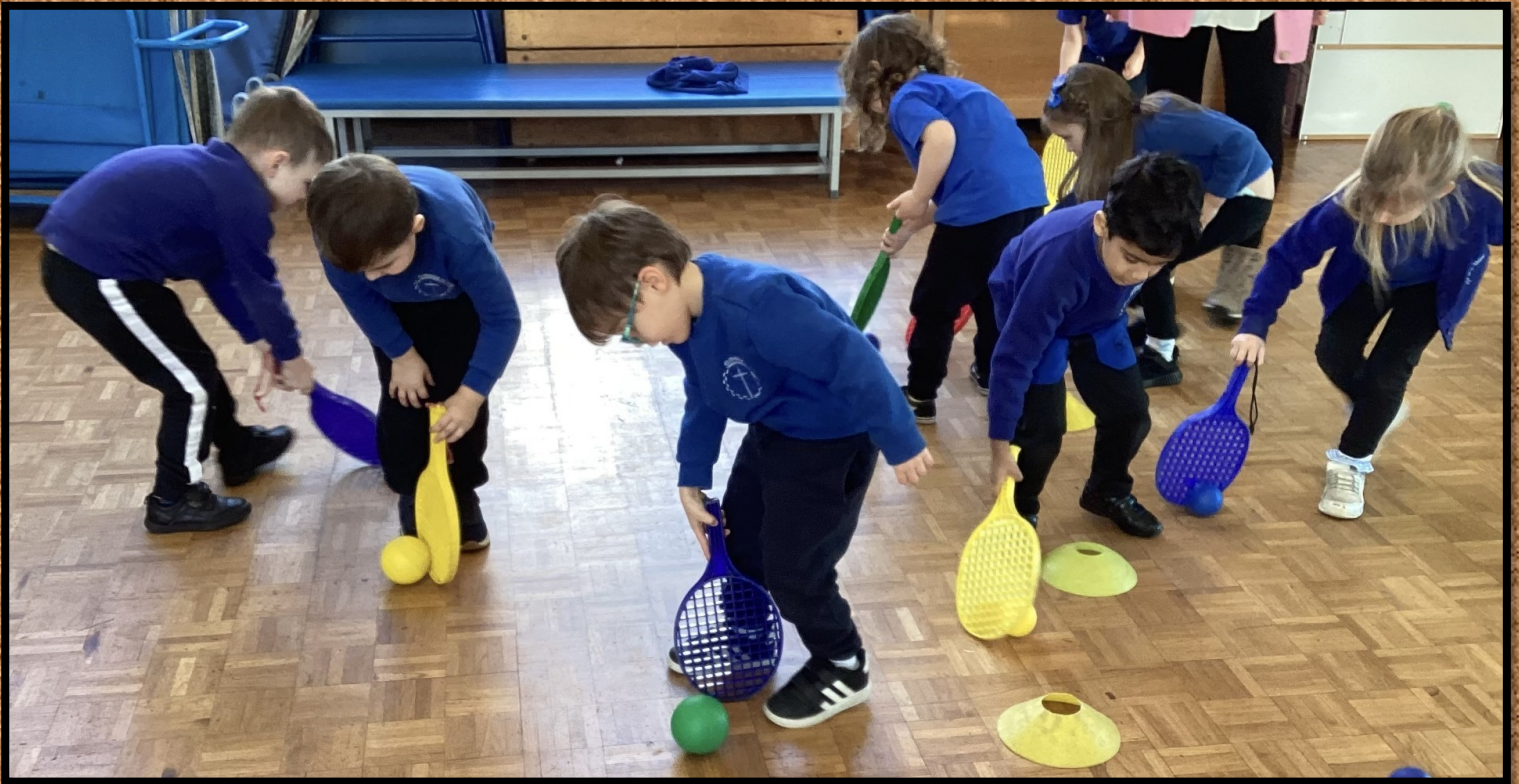
Acorn class trying hard to control the ball around obstacles.