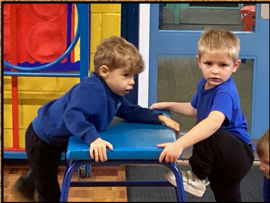
Acorn Class have been travelling over the table in PE this week!