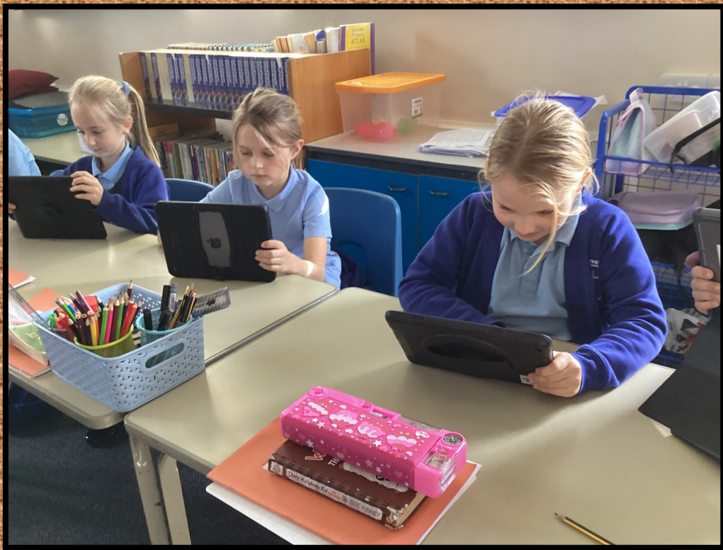
Chestnut Class completing their IT quiz about digital devices.