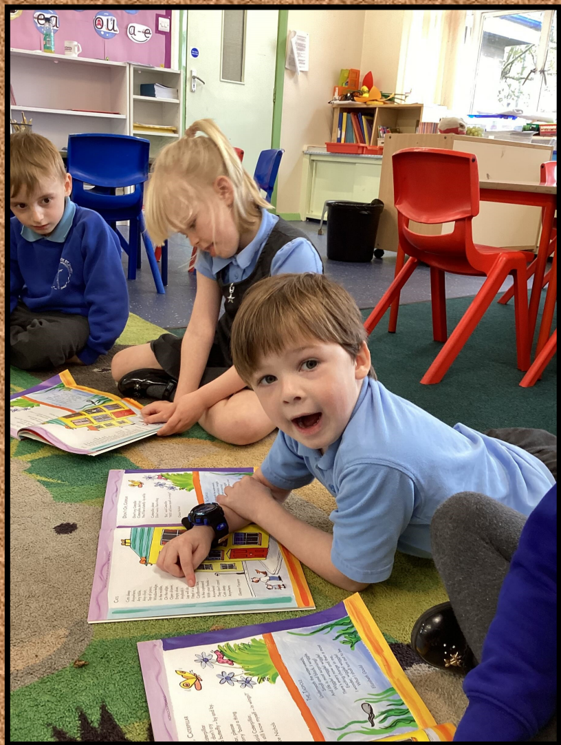
Oak Class have been reading and performing poetry this week.