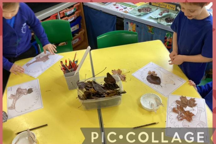
Ash Class enjoyed using autumn leaves to create lovely pieces of art work.