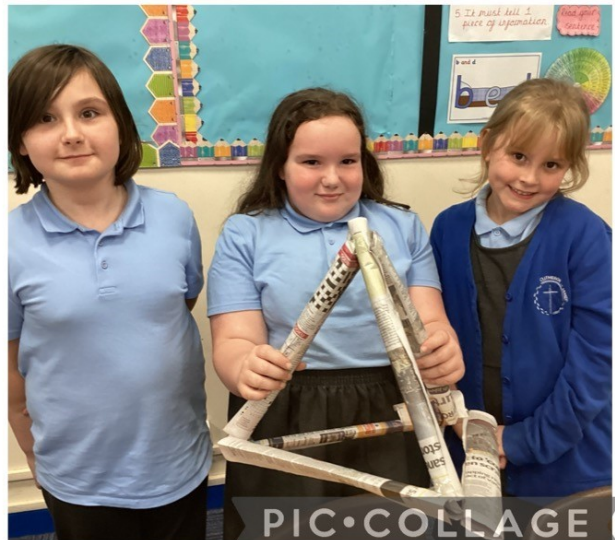
Hawthorn have enjoyed making 3D shapes out of newspaper in their art lesson